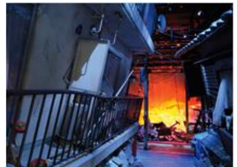
From "HOKUDAN EARTHQUAKE MEMORIAL PARK"