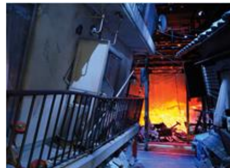
From "HOKUDAN EARTHQUAKE MEMORIAL PARK"