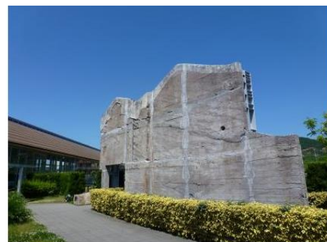
From "The Great Hanshin-Awaji Earthquake memorial museum(DRI)"