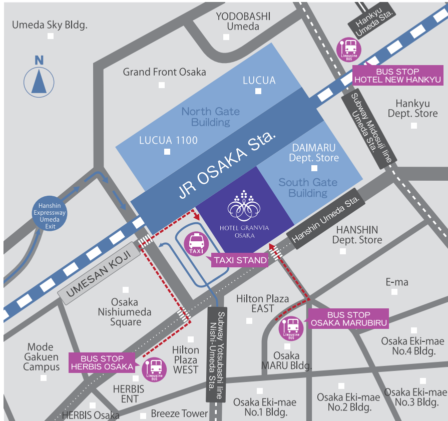
Airport limousine bus stop